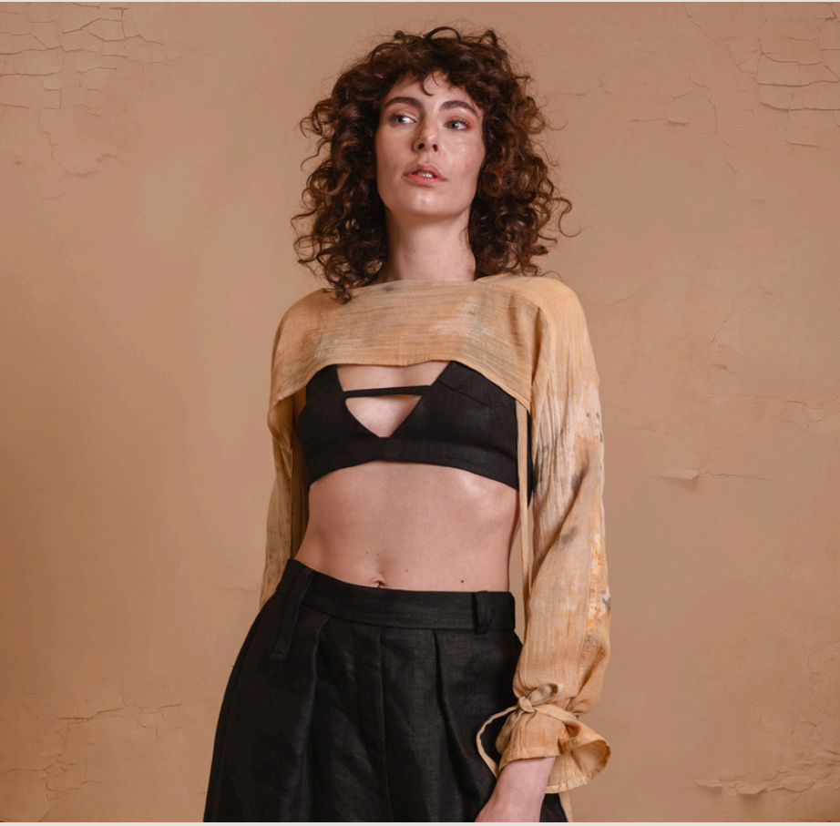
NODUS BRALETTE - HEMP