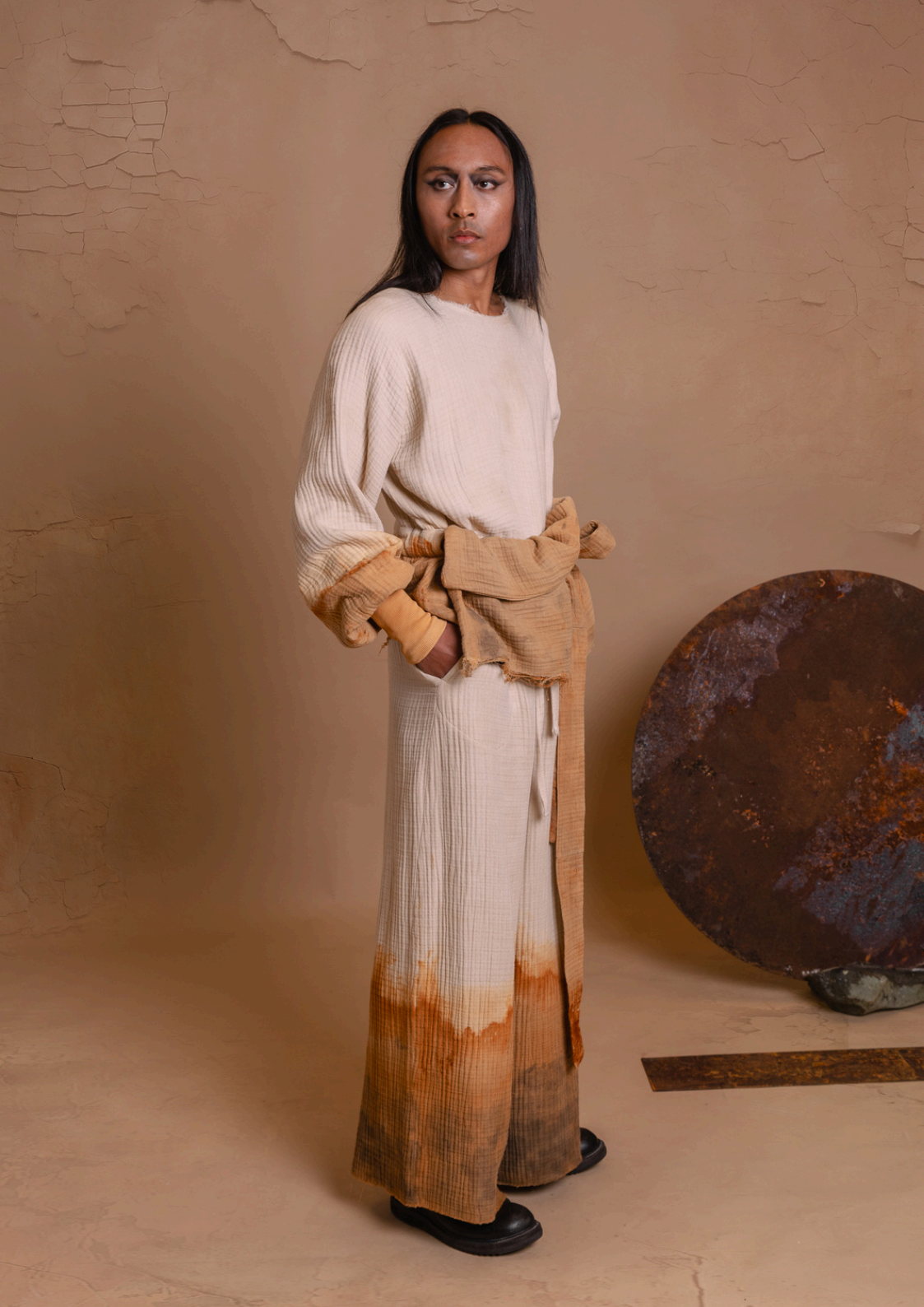
SOLUM TROUSERS - Muslin cotton