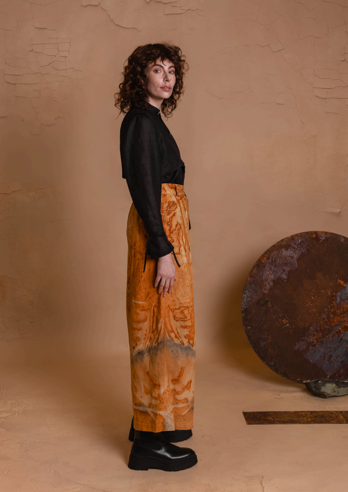
SERAPH BLOUSE - HEMP