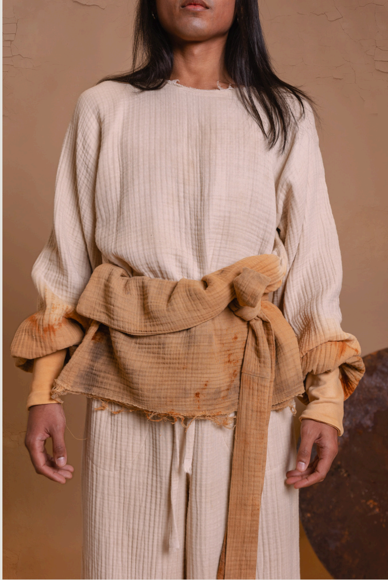
AETAS SWEATER - MULTIFUNCTIONAL WEAR