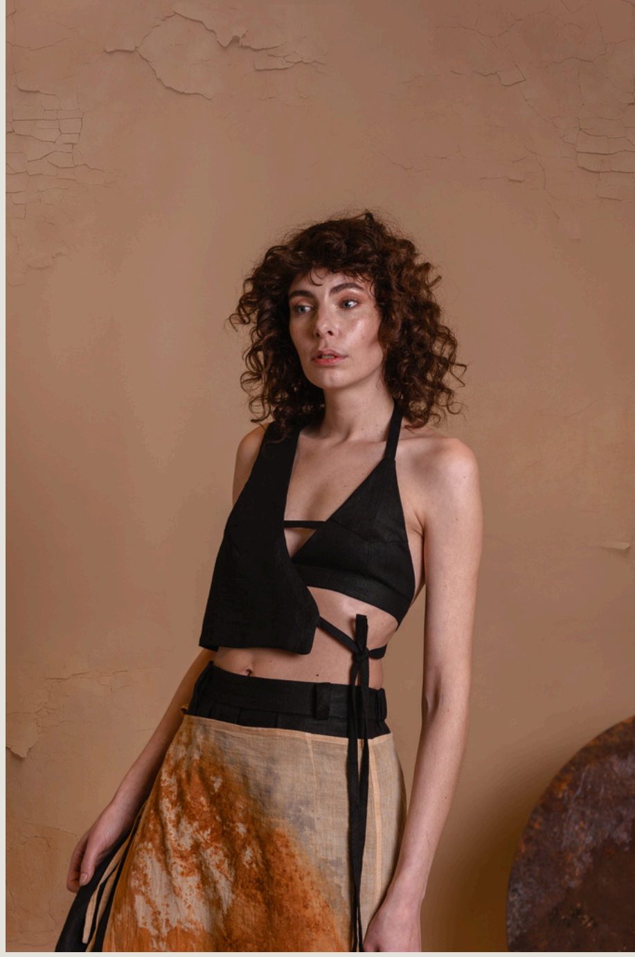
DATE TOP - HEMP