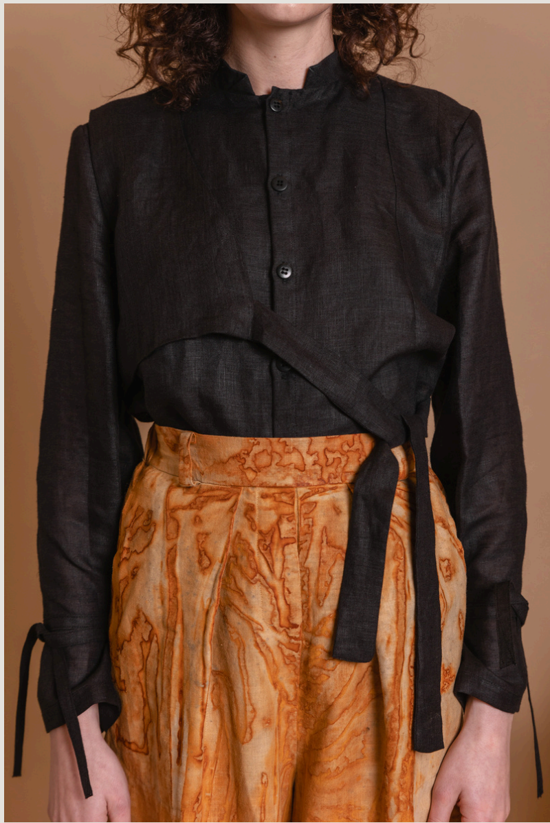
AGER TROUSERS - HEMP --- SERAPH BLOUSE - HEMP