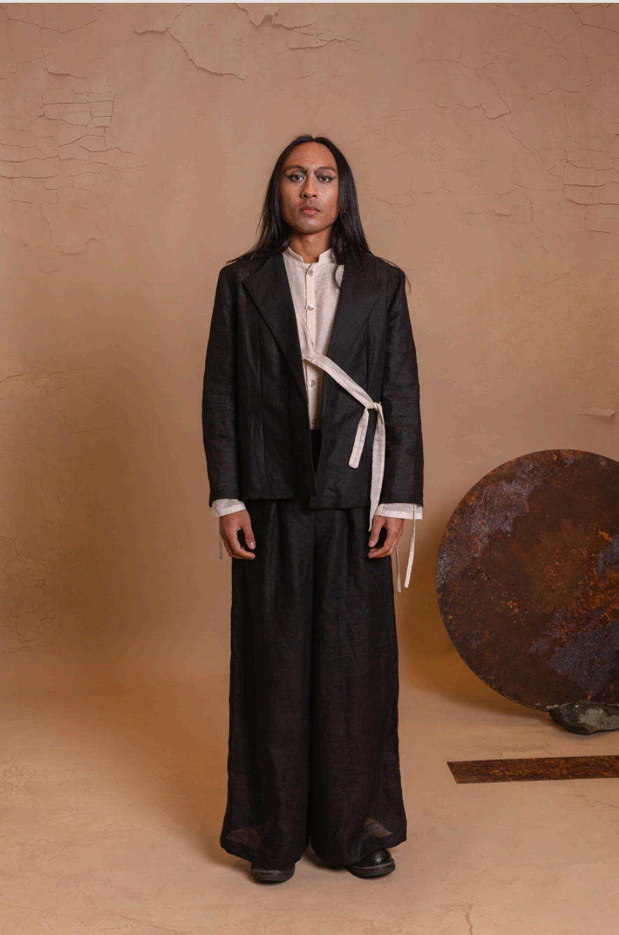
SUIT OXIDATE - HEMP