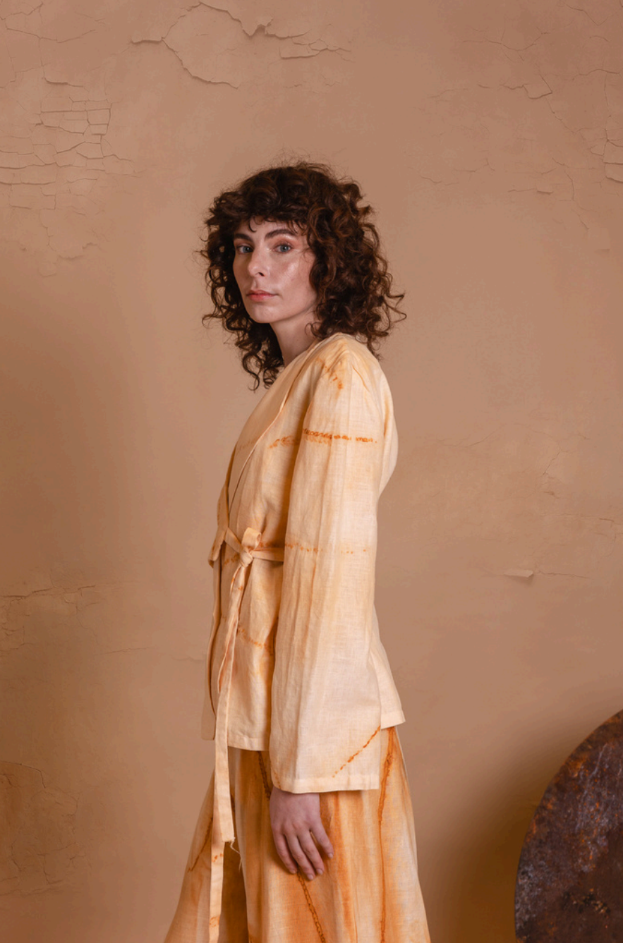
SUIT OXIDATE - HEMP