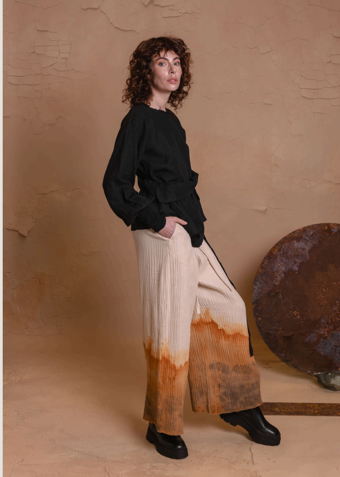
SOLUM TROUSERS - Muslin cotton