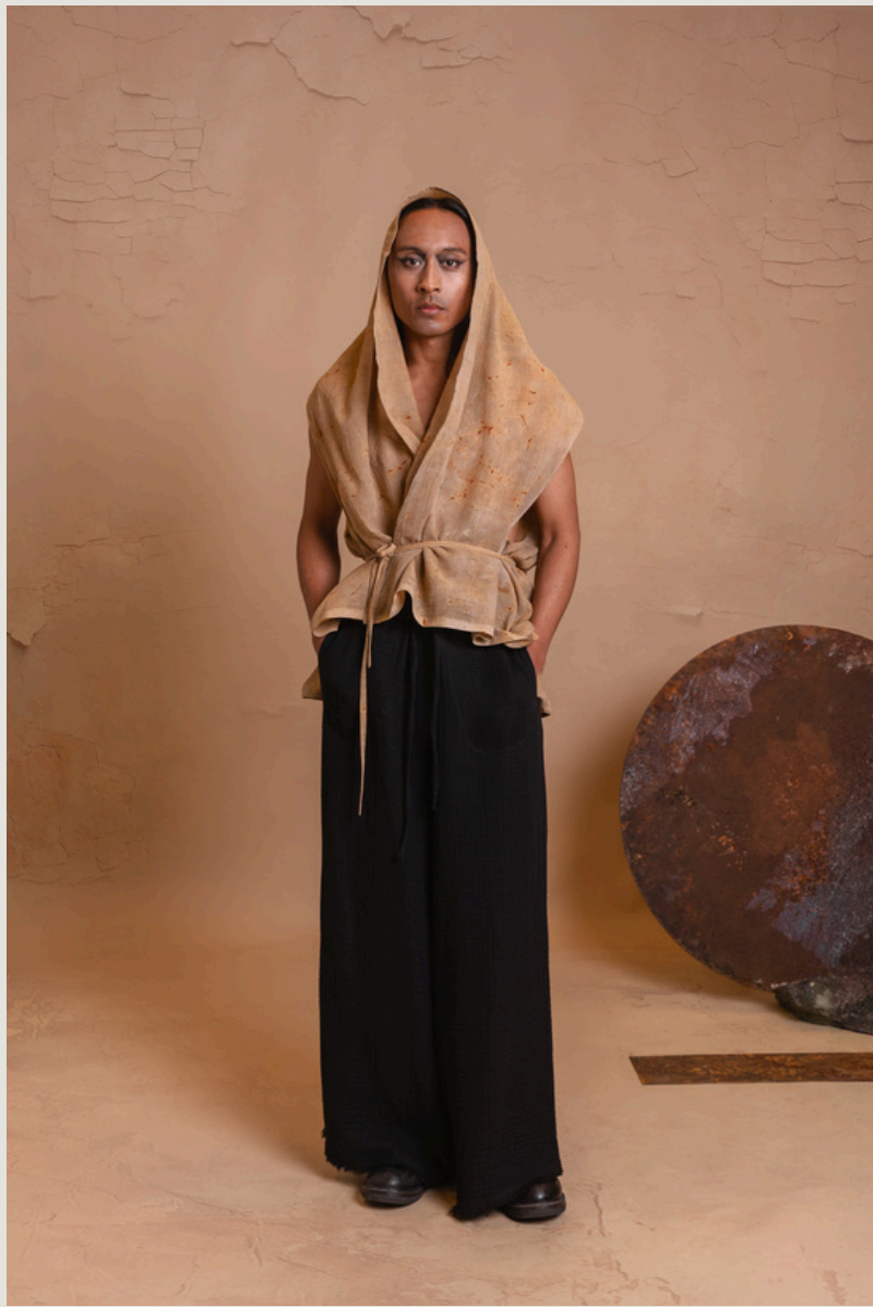
SOLUM TROUSERS - Muslin cotton