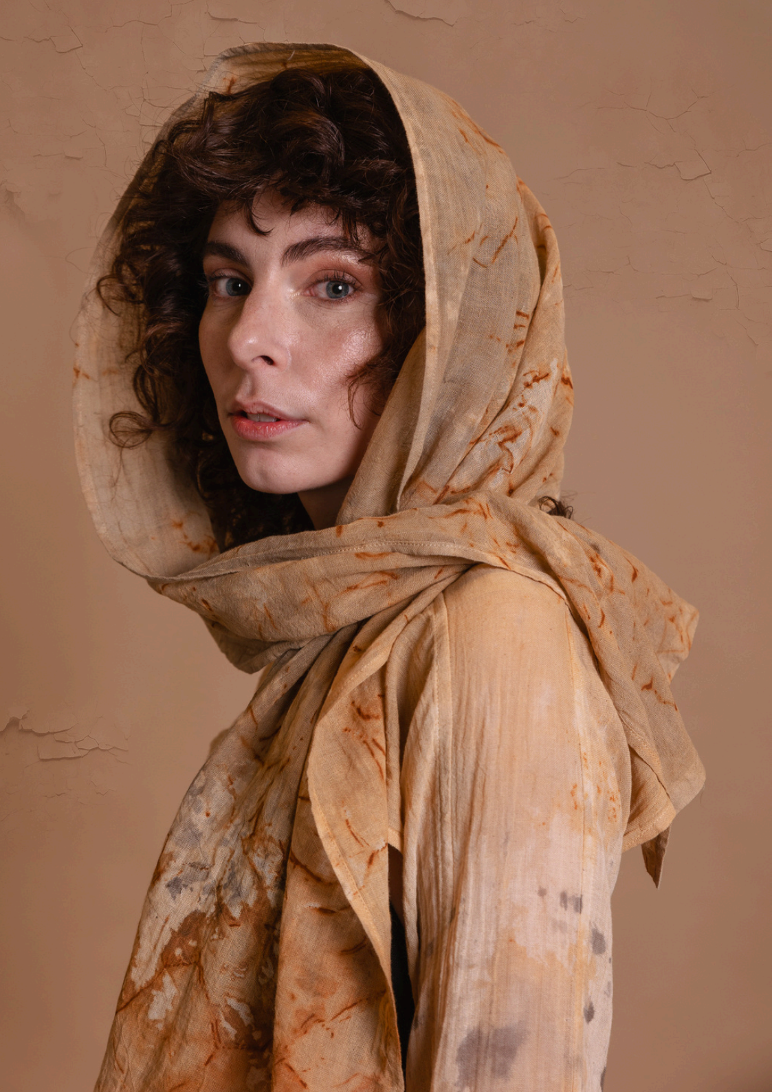
AERIS SCARF - BIO COTTON