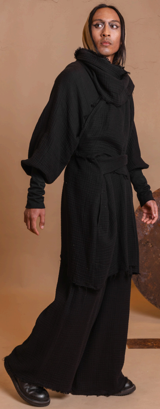
SOLUM TROUSERS - Muslin cotton