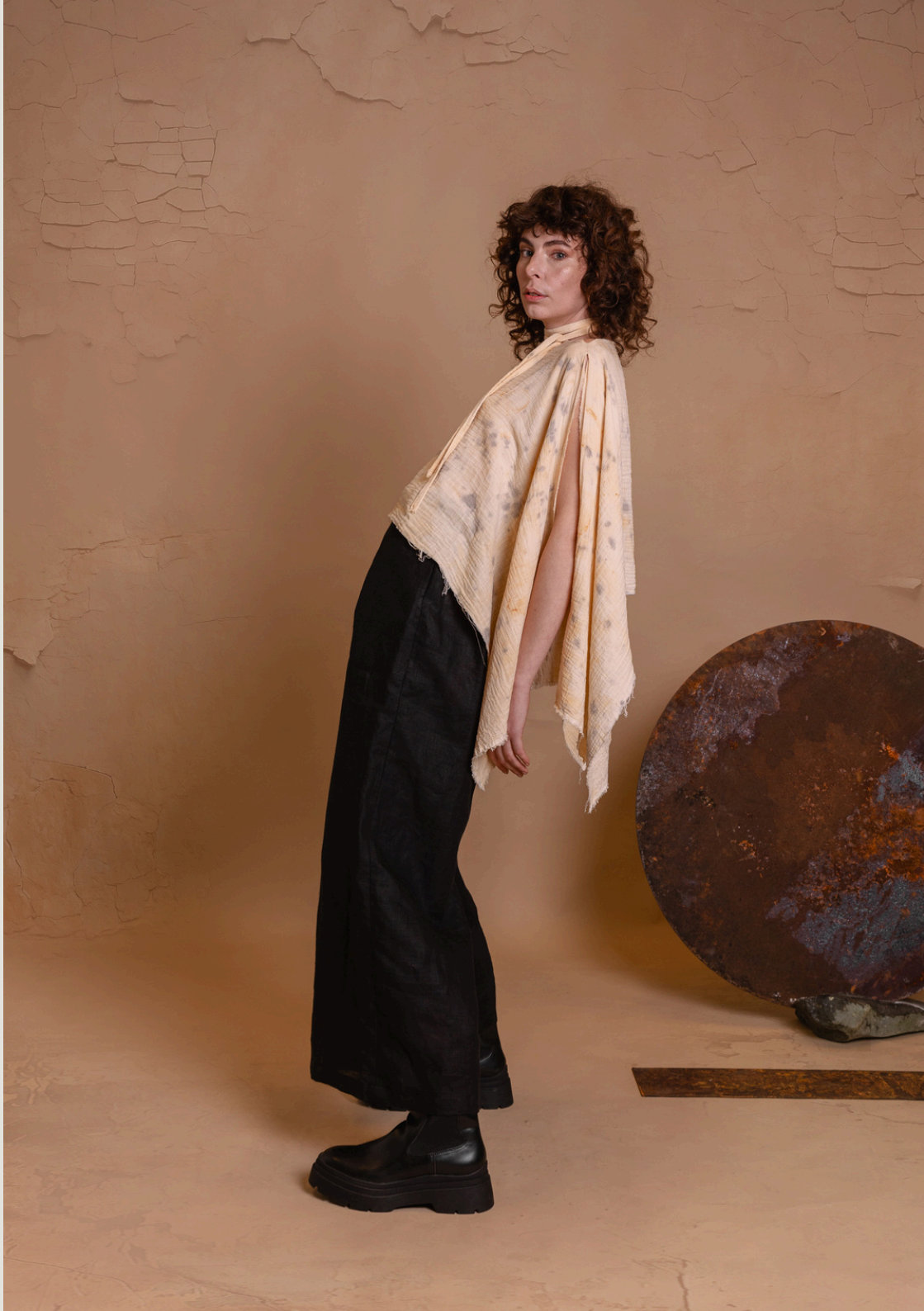
PATINA TOP - MULTIFUNCTIONAL WEAR