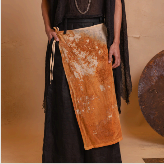
FERRO SKIRT - BIO COTTON