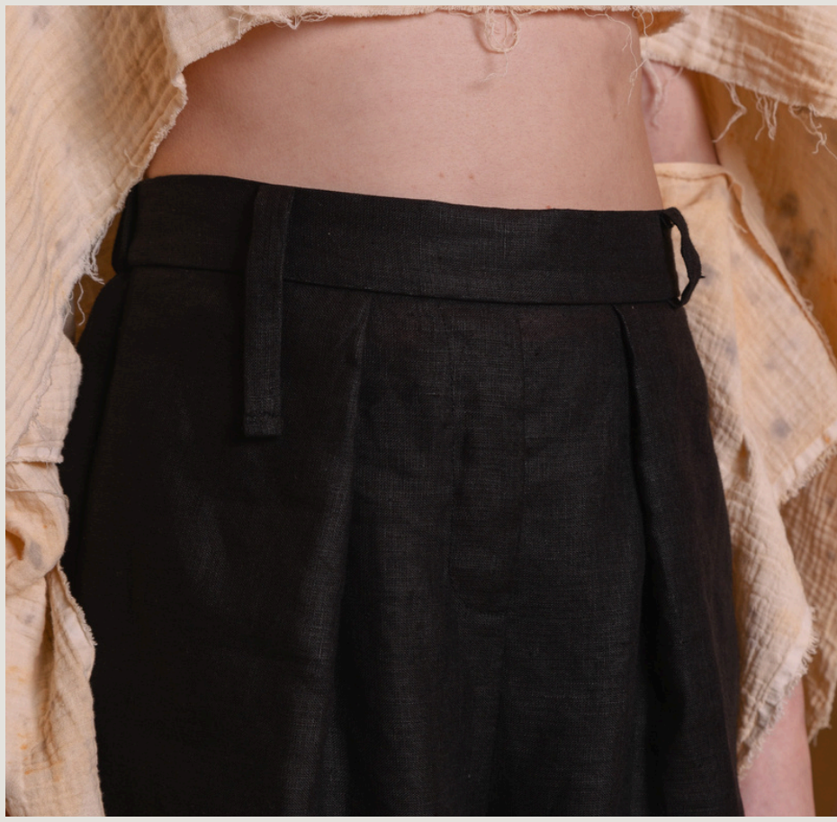
AGER TROUSERS - HEMP