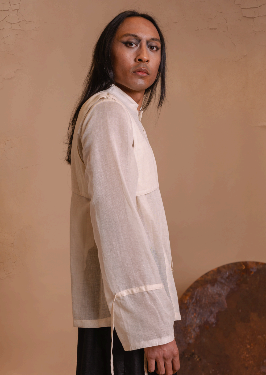
SERAPH BLOUSE - BIO COTTON