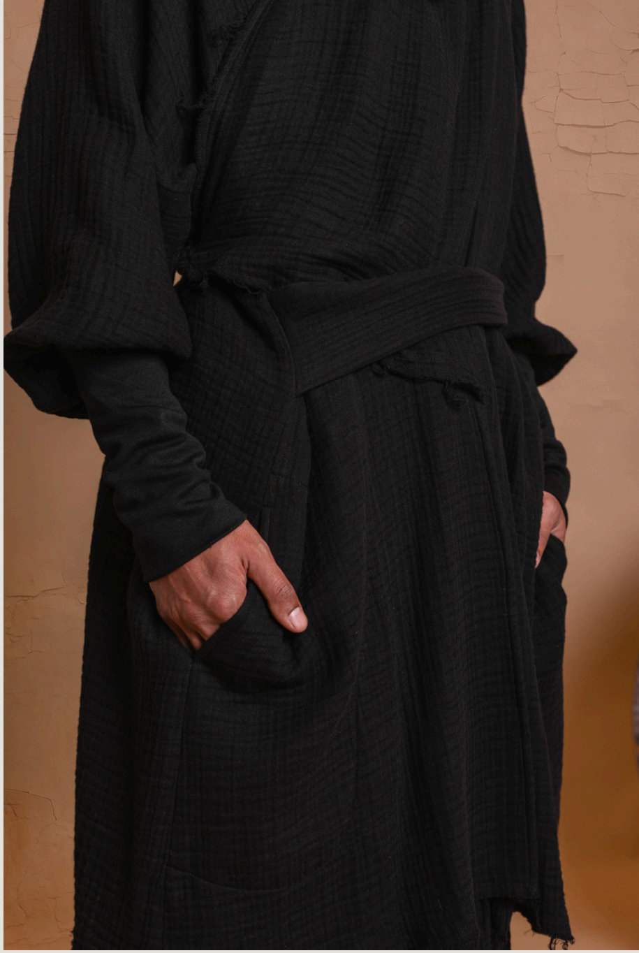
FISSURE JACKET - Asymmetrical, muslin cotton