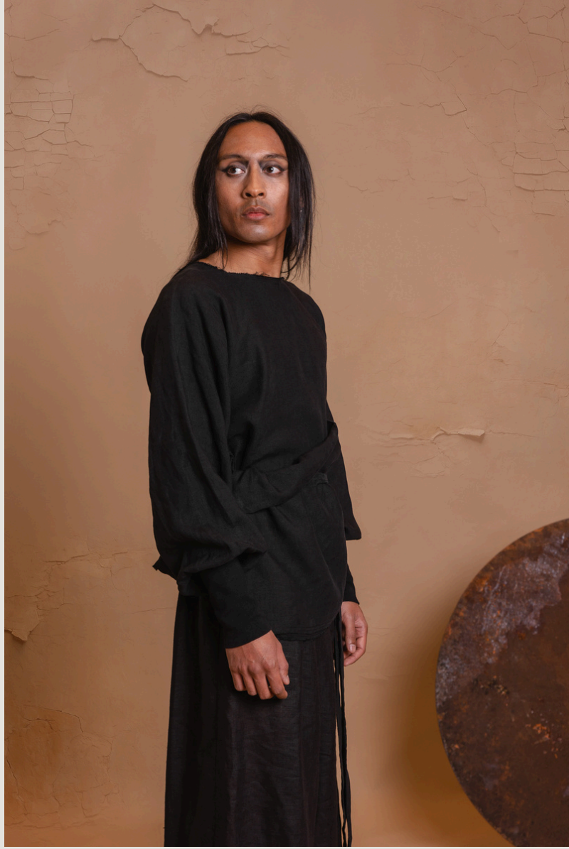
AETAS SWEATER - MULTIFUNCTIONAL WEAR