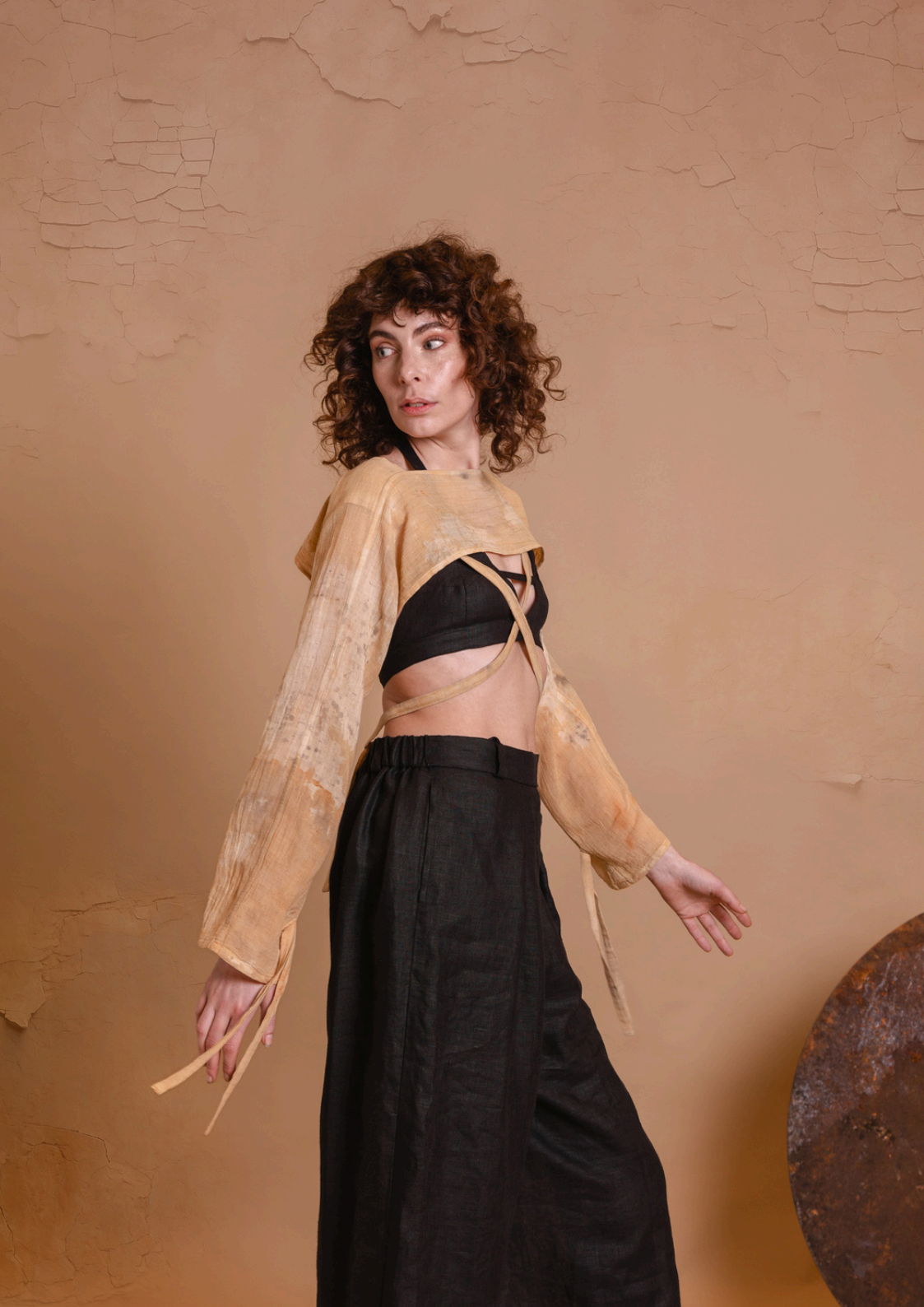
EROS LONG SLEEVE TOP - BIO COTTON