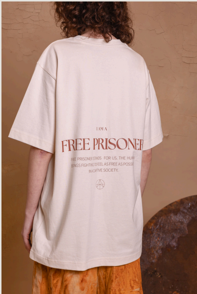
I AM A FREE PRISONER - Merchandise Stanley/Stella